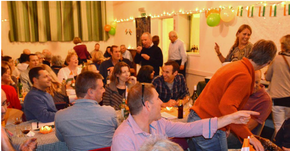
Curry night at the Village Hall in September.

Tickets are available at £9 each from Gaynor van Dijk on 680349.