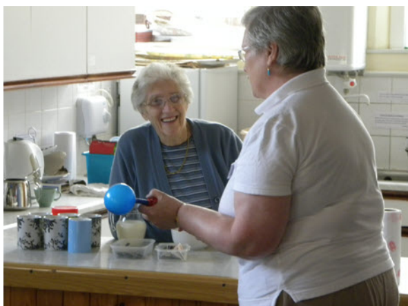
Getting ready for action.

In August, our status changed; we are now part of the charity Omega Care for Life and the first of their network of Meeting Point Support Groups for Carers based in Warwickshire. We are the same friendly group, run by carers and dedicated to supporting each other, but we now have the backing of a national charity which will provide major support to those running the group. We would like to increase the number of ways in which we can support